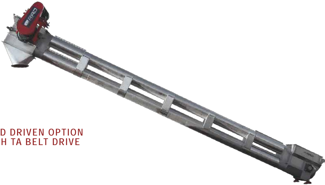
HEAD DRIVEN OPTION WITH TA BELT DRIVE